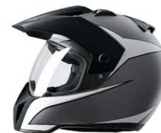
Colour scheme: Volt